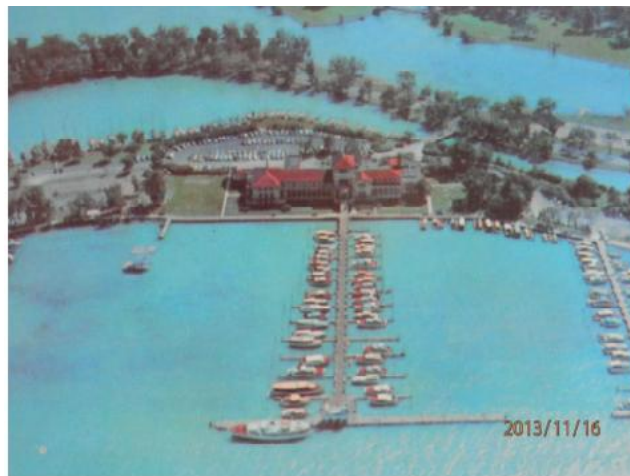
The Detroit Yacht Club around 1966.

The strong afternoon sun illuminated Belle Isle, the huge island in the Detroit River. As we drove over the bridge linking it to the city, we felt the freedom and excitement only having “wheels” could elicit. Snaking our way along the drive, we passed by great fountains. Off in the distance, a herd of deer ran from a golf course into the woods. We laughed at the prospect all these now-empty parking places would be packed tonight with steamed up cars. You had to know where you were going. The island was designed to confuse visitors, so it would project an air of mystery and exploration. We looped around the one-way road, through another golf course and saw the small island defining the privacy for the Detroit Yacht Club and giving the club more dock slips.