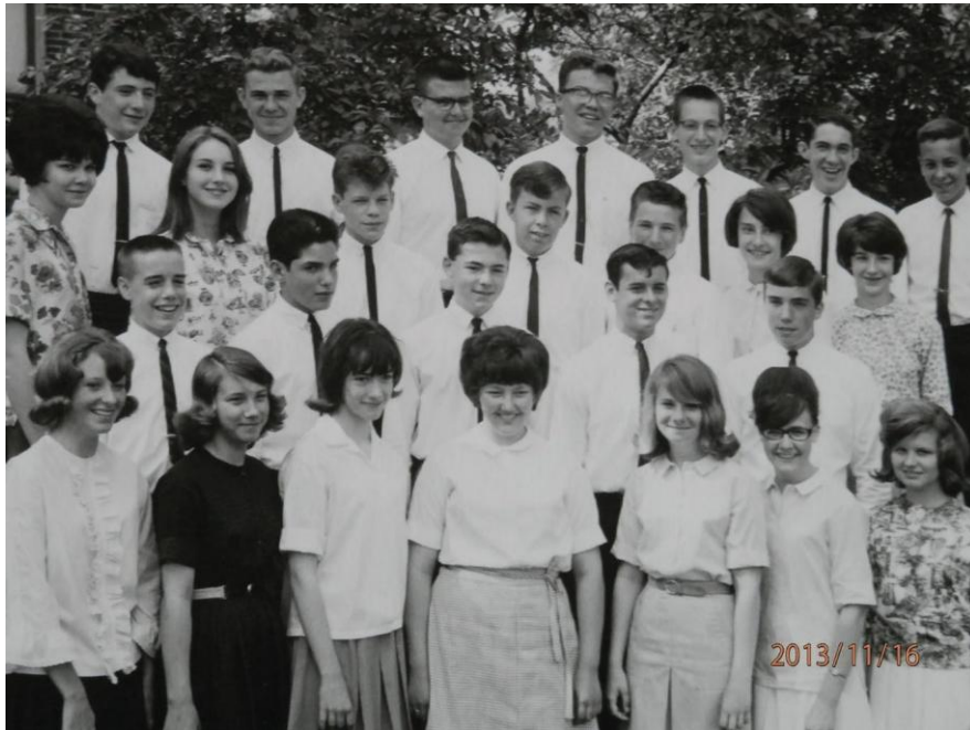
Graduation Picture of my classroom at Cadillac Junior High - 1964