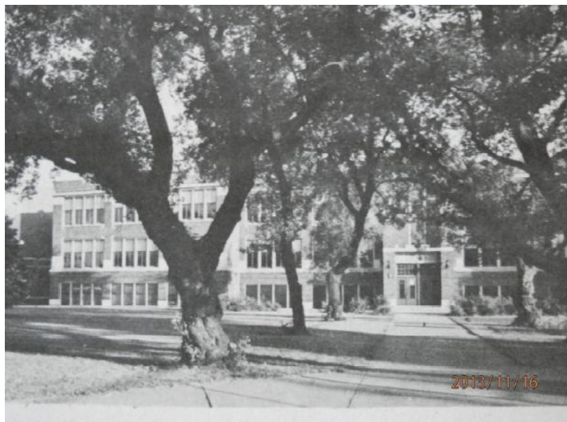
This picture only shows one-tenth the full size of the school.