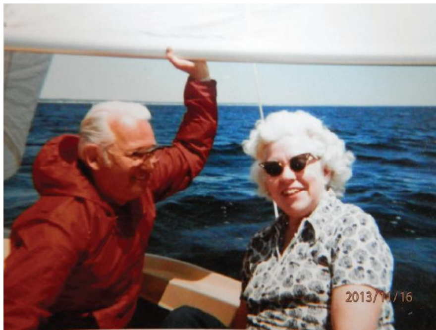
Dad and Mom on one of the few times they both went sailing with me on the "Spindrift."

drowning very difficult as long as you don't fall through the ice. Secondly, ice boating is all about speed, so timing is very important. At 60 to 80 mph, a mile that is far when sailing on water comes at you in less than a minute. Thirdly, when running (having the wind behind the boat) on water you let out the sail in order to catch the most wind. On ice, because of the speed, you have to pull the sail in to decrease the drag of the sail. Other than safety issues, like the thickness of the ice that is just about it. Soon I was flying around Walled Lake. I was able to help him a little on Saturdays for three hours and sail at the same time. Walled Lake was shaped like a bent figure eight. Late in the season a hole opened up in the middle of one of the "Os." I thought as long as you sail along the outer edge of the "O", the ice would be thick enough for the boat. For three-fourths of the circle my theory held true. However as I crossed the last one-fourth of the circle, I saw to my horror that each circle had a big blue center. I was sailing across an ice-bridge at 60 mph where the ice was getting noticeably thin. I made it, but I would never do that again. It had been pure luck that kept the boat from breaking through the ice.