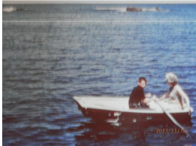
Taking Mom for a row in the “Sieve” from Narrow Cove.