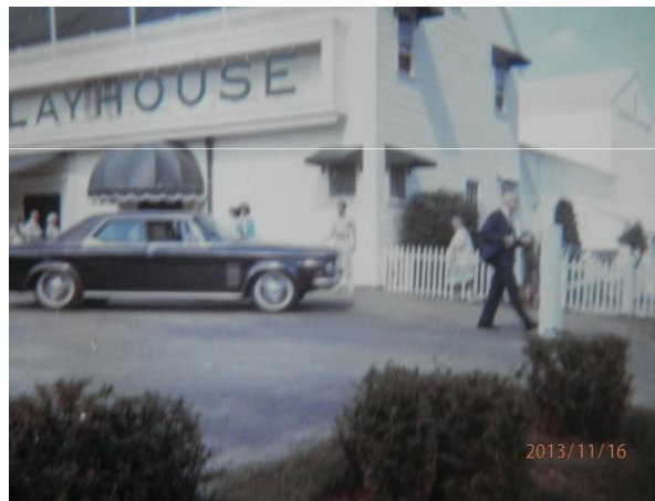
Parking cars at the matinee

My Fair Lady was one of the big musicals that summer. The actor who played Freddie was an out-of-control gay man, but I did not know it. In the first position, as a car parker, our job was to turn traffic left to the parking field. As I directed cars left, he would try and grab me as he drove straight into the employee's parking. It seemed as if he was just another backstage idiot. I gave it little thought.