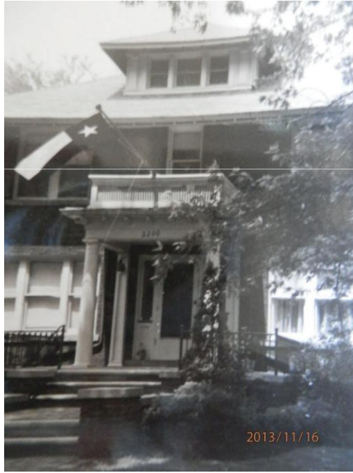
Our house at 2200 Edison Ave. with Tom's Texas Flag