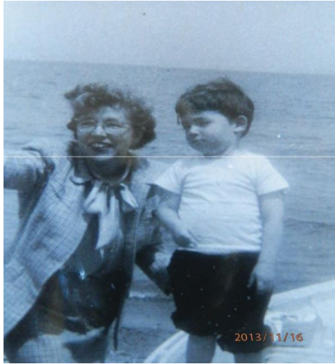
Mom and me at the Gross Point Yacht Club on Lake St. Clair