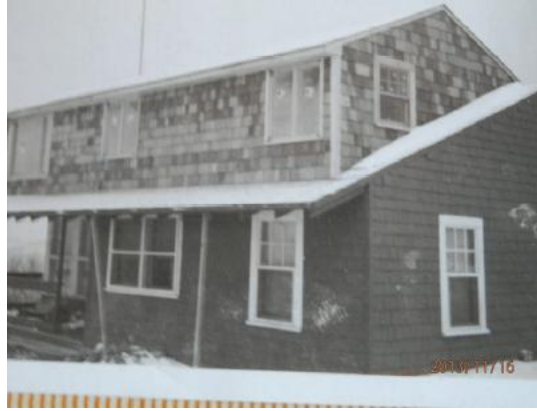
Cottage on Juniper Lane with new addition