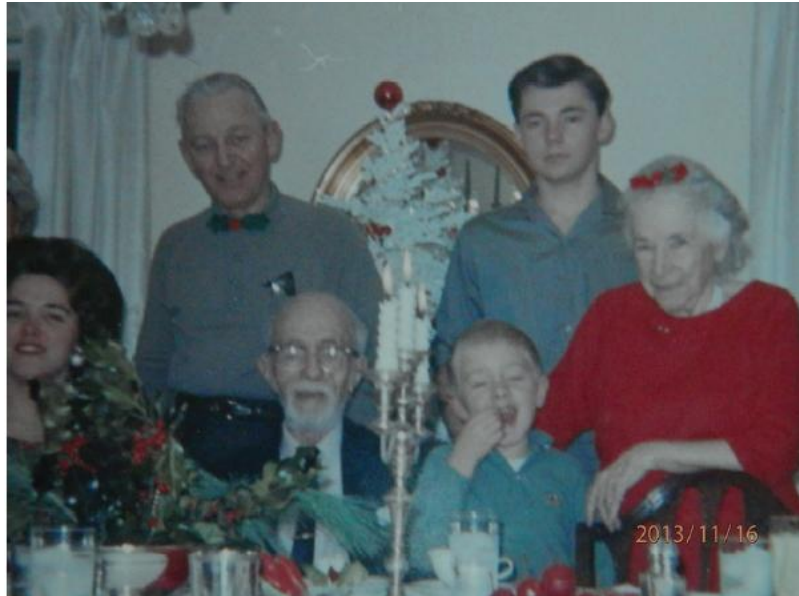
The last Christmas with Grandma